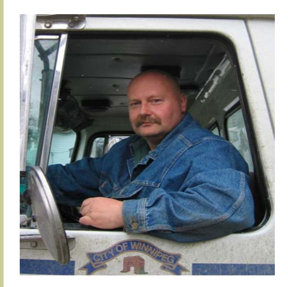
Public Solid Waste workers could lose their jobs if City officials contract out garbage collection in Winnipeg

City Councillors will make a decision on July 27. So call them now. Help keep our services public!