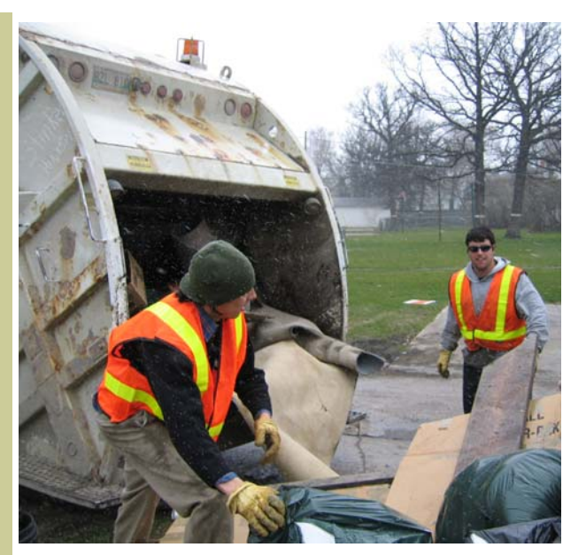
City workers take pride in doing the best job for Winnipeg

We're the city workers who pick up your garbage. We are your neighbours and friends and we are proud to provide this service for you the residents of Winnipeg.